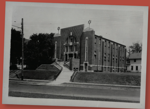
The former Tifereth B'nai Jacob synagogue, aka, the "Elwood Shul," is now the home of First Church of God in Christ – Graham Temple.