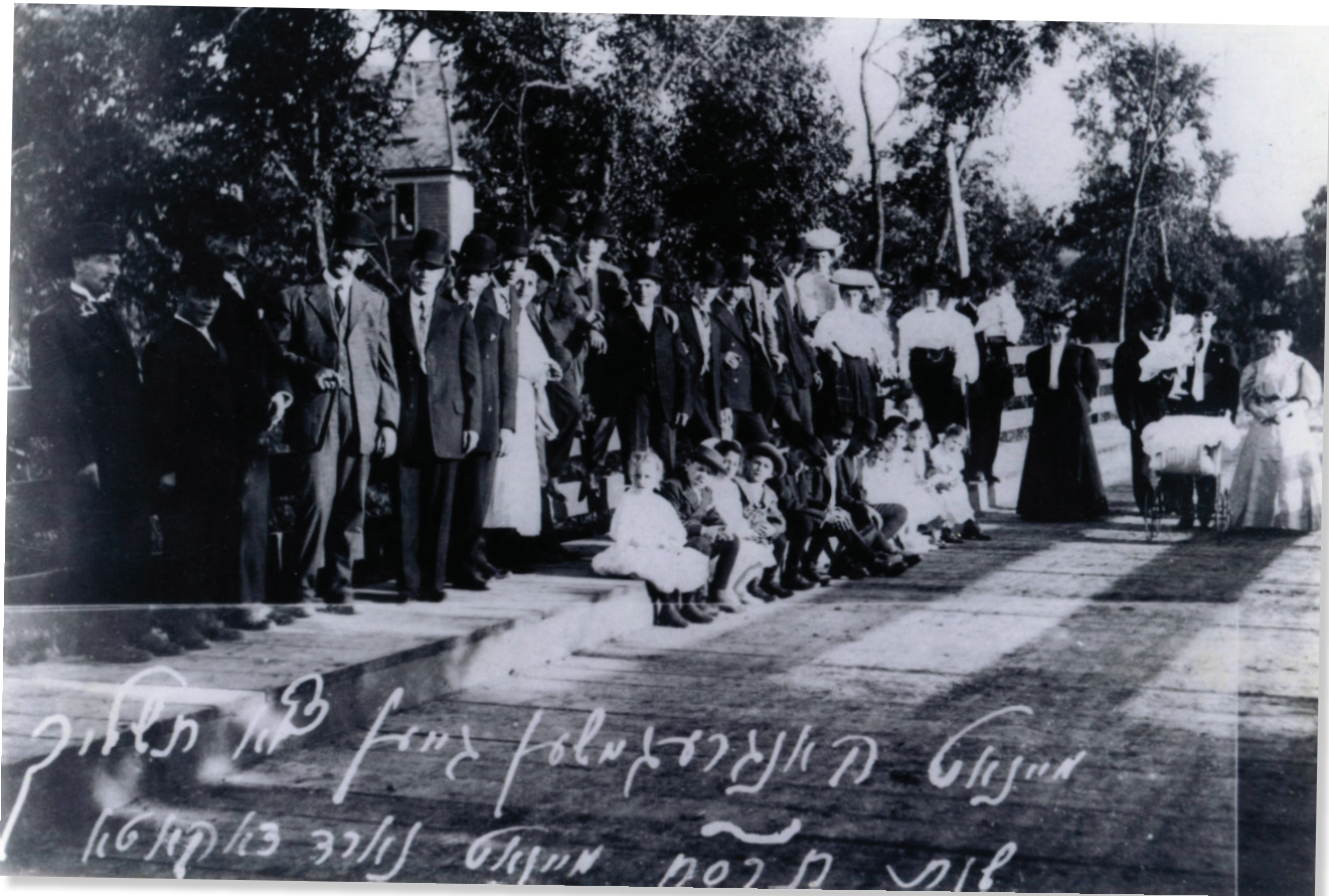
Taschlich at Minot shul early 1900s.