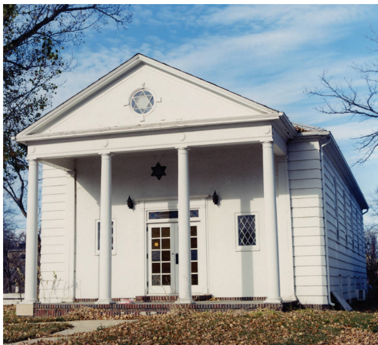
Temple Beth Israel, Minot, North Dakota (building remains standing, but congregation is no longer in existence).